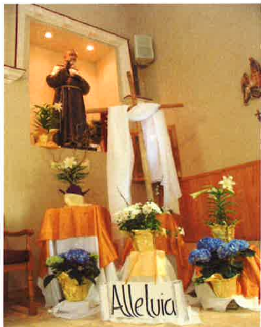
Oakfield Site 56 Maple Ave., Oakfield