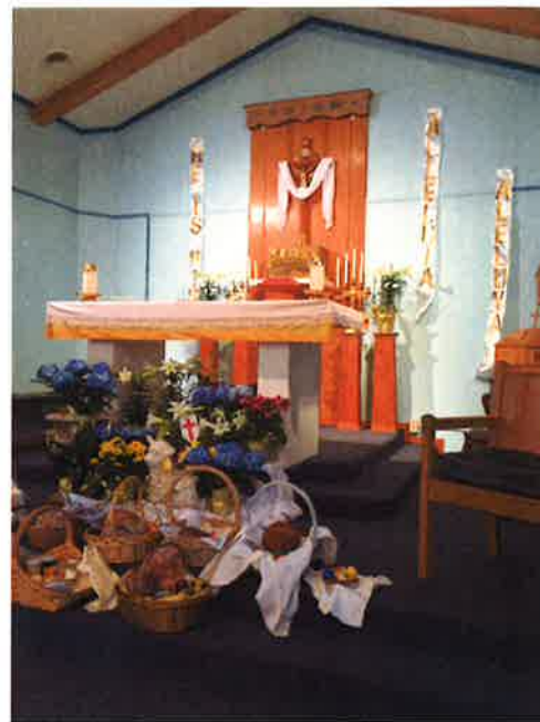
Elba Site 65 S. Main St., Elba