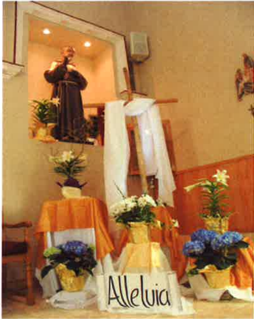
Oakfield Site 56 Maple Ave., Oakfield