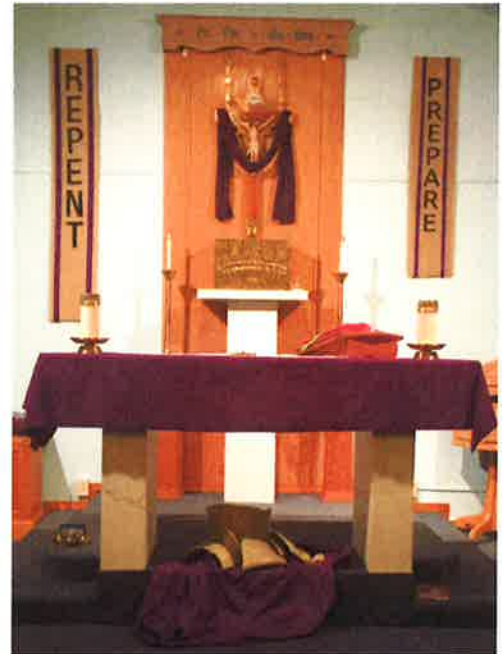
Elba Site 65 S. Main St., Elba