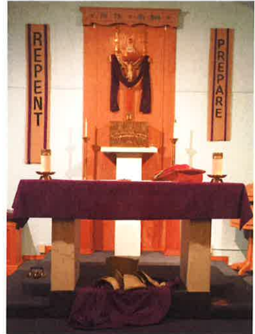
Elba Site 65 S. Main St., Elba