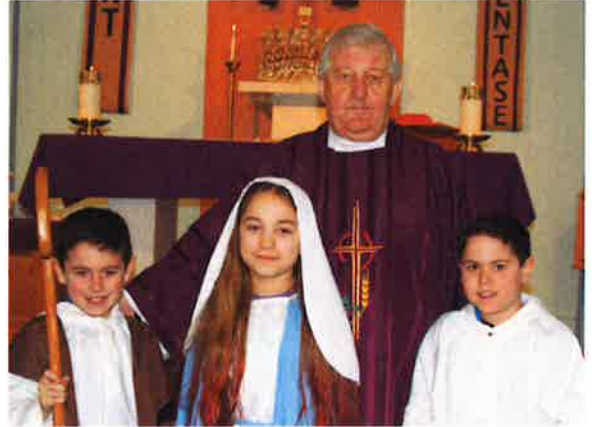
2017 St Joseph's Tradition

The proceeds from last year and this year's tables will be put towards the initial stocking of the Share the Journey Outreach Center Closet with non-food items. We ask you to donate generously as you enjoy the rich tradition of St. Joseph's Table. Please join us in our celebration to honor St Joseph on March 18th . The table will be held in the Elba social hall after both 8 and 10am mass. Meatless dishes are appreciated and welcome. Come join the fun and take a chance on one of the many raffle baskets; as well as great food and fellowship.