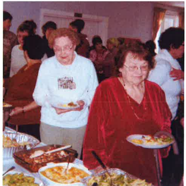
2017 St Joseph's Table Festivities

If you are able to contribute a basket or donate for the basket raffle call Pauli Miano 585-356-1561.