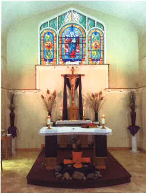
Oakfield Site 56 Maple Ave., Oakfield