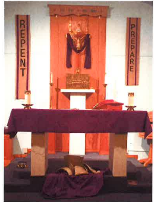
Elba Site 65 S. Main St., Elba