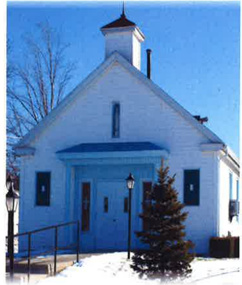
Elba Site 65 S. Main St., Elba