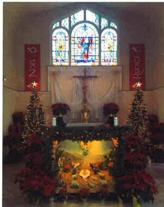
Oakfield Site 56 Maple Ave., Oakfield