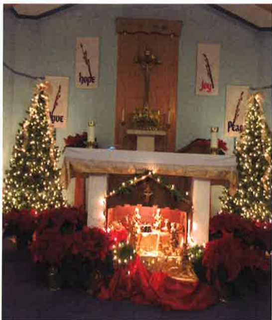
Elba Site 65 S. Main St., Elba