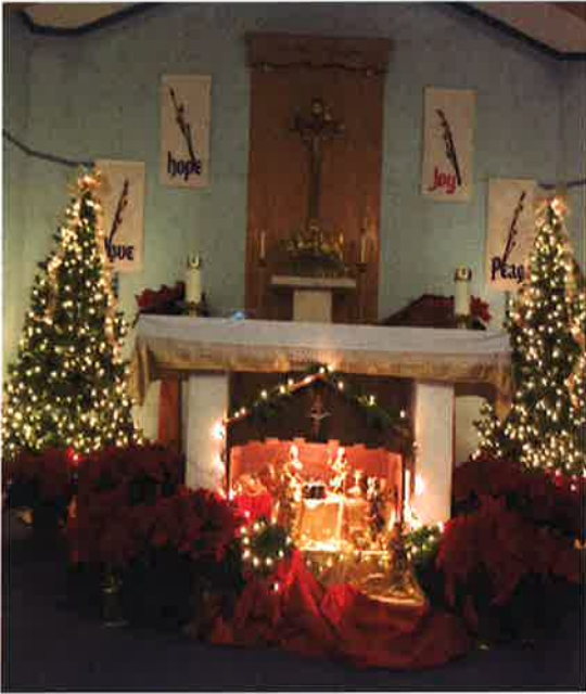
Elba Site 65 S. Main St., Elba