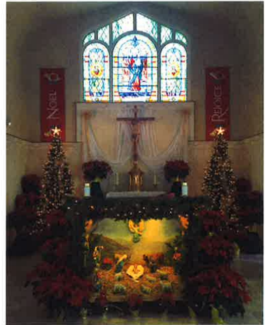
Oakfield Site 56 Maple Ave., Oakfield