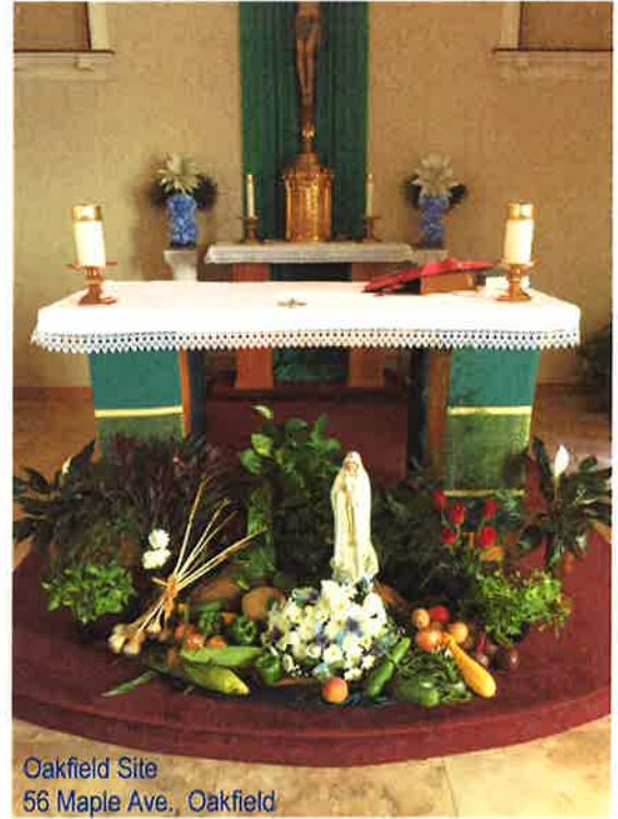
Oakfield Site 56 Maple Ave., Oakfield