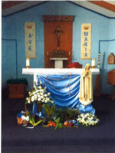
Elba Site 65 S. Main St., Elba