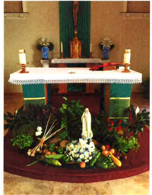
Oakfield Site 56 Maple Ave., Oakfield